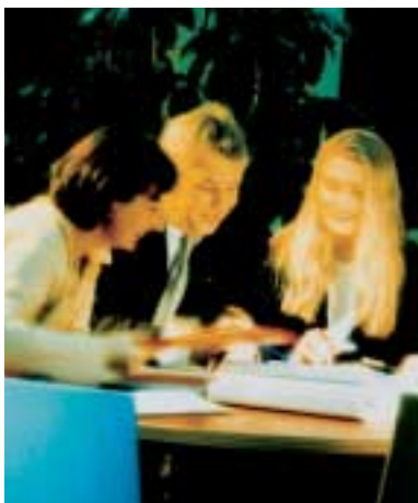
ENGINEERING STUDENTS MEETING WITH THEIR HOST COMPANY.

Industry and commerce will continue to grow based on numerous small and medium-sized companies representing a wide range of business activities. Growth will mainly be within the private service sector. Both existing and new manufacturing companies will maintain a strong position. In its role as a major regional centre, Jönköping will strengthen its position as a leading regional labour market attracting many commuters. Development and growth will be facilitated by national and international networks for knowledge dissemination, offering platforms for interaction between different interest groups.