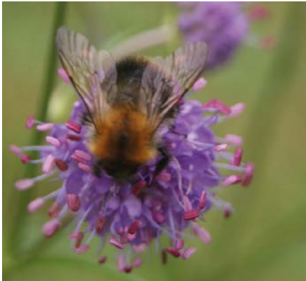
Tree bumblebee on devil's bit scabious

viper's-grass, melancholy thistle, devil's bit scabious, and here and there, leopard's bane.