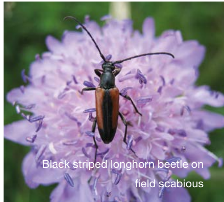
Black striped longhorn beetle on field scabious

On the other side of the railway there is much dead wood. In the northern part of the area there is also a very large pine tree.