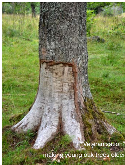
“Veterinisation” - making young oak trees older