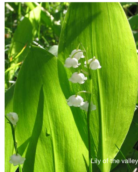
Lily of the valley