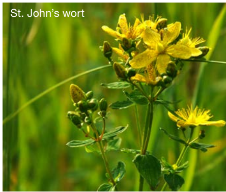
St. John's wort