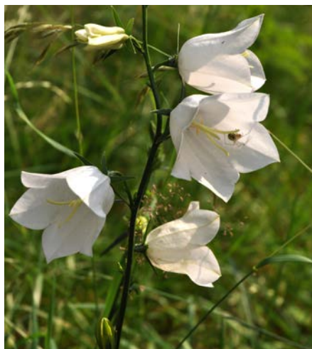
White variant of peach-leaved bellflower