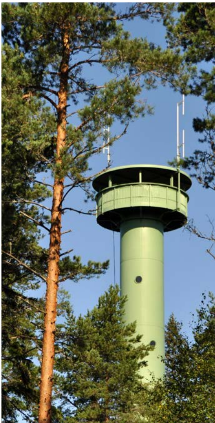
The Tegnér Tower