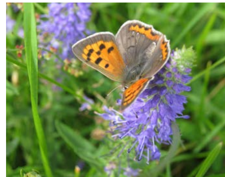
Spiked speedwell with small copper