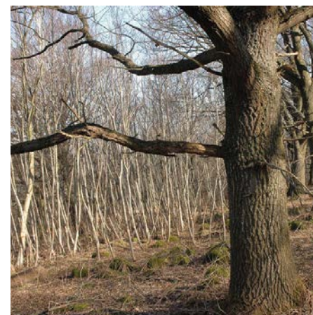
The jungle of grey alder prior to restoration