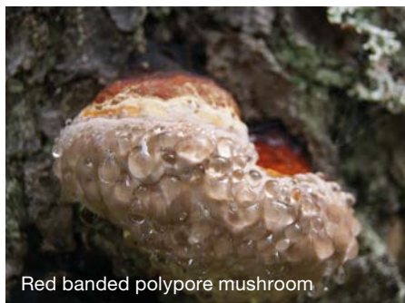
Red banded polypore mushroom