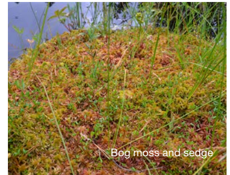
Bog moss and sedge