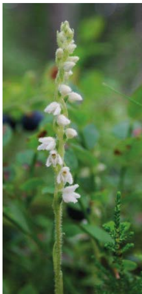
Creeping lady's tresses

Many paths and jogging tracks criss-cross the forest. Between Domsand in the north and Vidablick