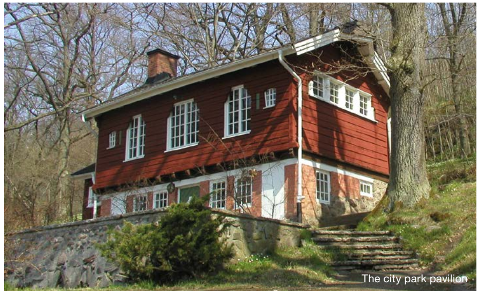
The city park pavilion