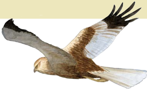
Marsh harrier ♂

burbot, arctic charr and eel. Some twenty species of fish have been recorded in the lake, and the commonest are perch, roach, rudd and ruffe.