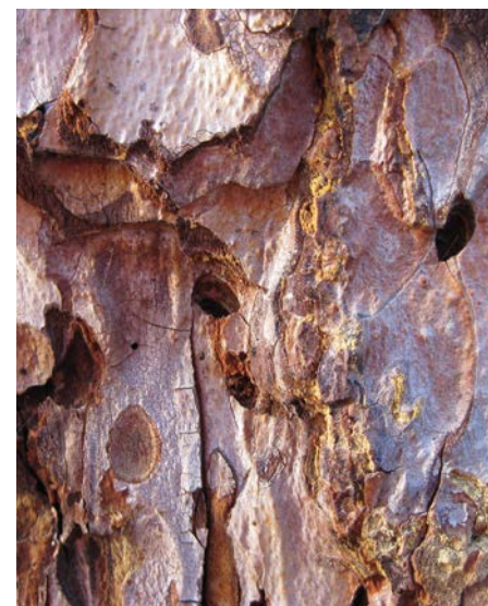
Hatching hole of longhorned beetle in an old pine tree