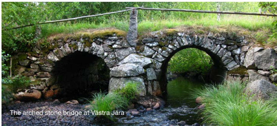
The arched stone bridge at Västra Jära