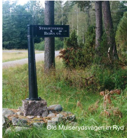
Old Mulserydsvägen in Ryd