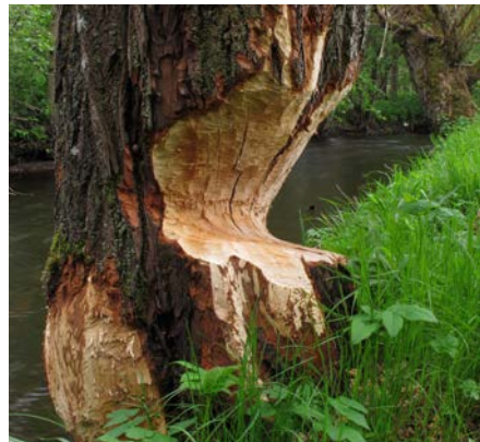
Tree gnawed by beaver

During late autumn when winter is approaching, the salmon trout prepare to migrate up-river for spawning. The Tabergsån river is included in a major conservation project, and hindrances to this migration have been removed. Consequently, the number of young salmon trout in the Tabergsån river have increased. One of the measures involves the dam at Hökhult, which is a heritage item, but the salmon trout can now pass by it. Another example