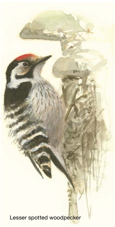
Lesser spotted woodpecker